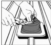
1. Adjust DEKTITE® to the pipe.

Use folding blind rivets for fibre cement boards. Profile height max. 45 mm.