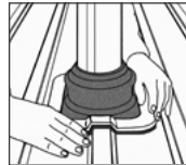
3. Adjust DEKTITE® to the shape of the profiled sheet.