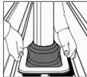
2. Adjust DEKTITE® to the profiled sheet and mark.