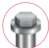
SUPERPLUS SLS A4