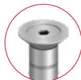
SUPERPLUS SKLS A4