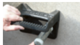
3. Place the step iron anchor through the hole in the step iron using the push-through method.