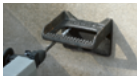
5. Drill and clean second hole. Step iron serves as plate drill jig.