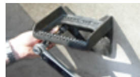
6. Position step iron anchor and tighten with a torque wrench with T_{inst} = 25 \text{ Nm} .