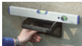
4. Align step iron.