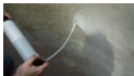
2. Clean drill hole.