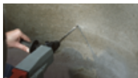
Easy installation - quick and reliable embedment: 1. Drill hole.