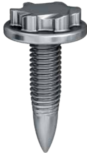
FDS® M5 Standard

These new lightweight designs have increased usage of high-strength steels whose tensile strengths are >600 MPa. For these types of applications, EJOT has developed the FDS® M4 High-Strength screw that meets the high demands of these types of materials while also directly contributing to weight savings.