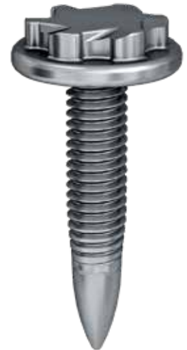
FDS® M4 High-Strength